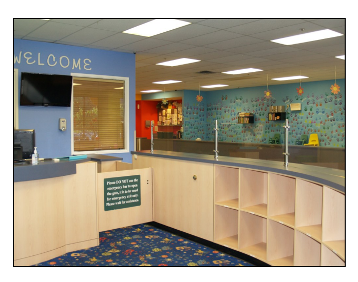
For the safety of all children, parents must refrain from entering into the inner area of Childcare.

Only parents and legal guardians may check out their children from Childcare. Nannies Grandparents, and other Childcare providers may not utilize the Childcare facility.